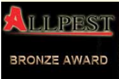
New York Festival Award

Allpest's rat radio advertisement "We Don't Negotiate with Rats," has picked up a Bronze at the 2011 New York Festivals Advertising Awards.